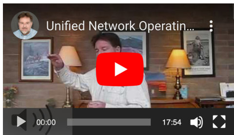
2018 discussion on a unified EAI OS