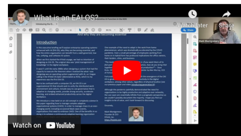
2023 talk walking through this paper